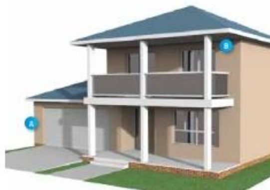
Typical double storey home showing: