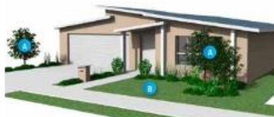
Typical front yard showing 50% softscape with: