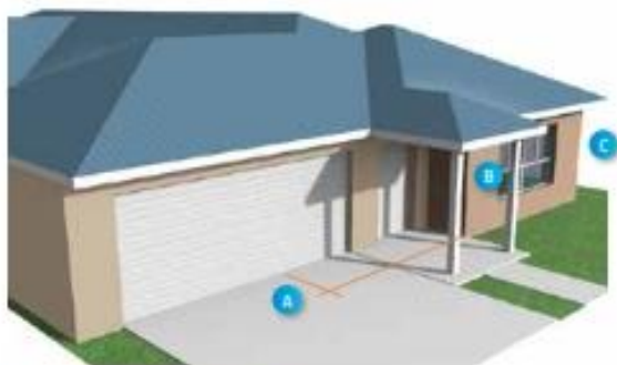
Typical single storey home facade showing: