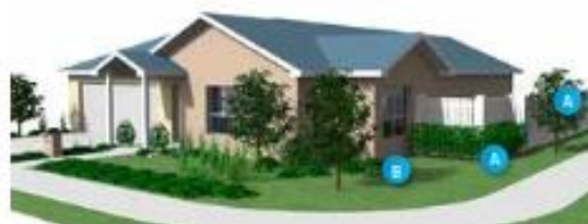
Typical landscape secondary frontage: