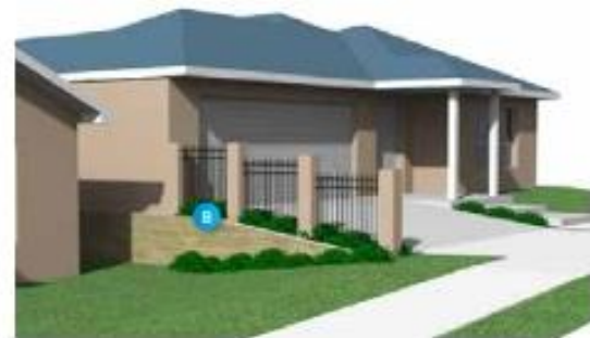
Retaining walls forward of the house must taper on side boundaries.

A And must be stepped when they exceed 1 metre high on front boundaries