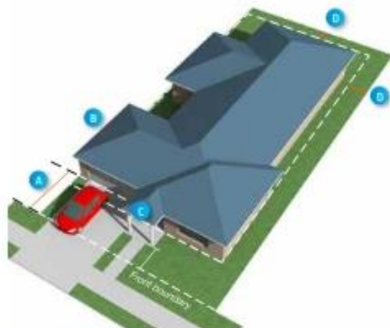
Typical home built to its setback plan showing:

Contact Lend Lease should you require any further information regarding setbacks.