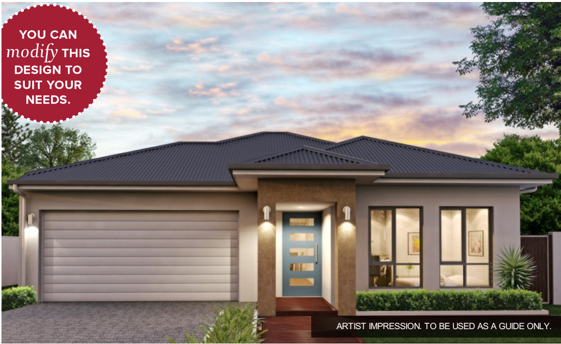
ARTIST IMPRESSION. TO BE USED AS A GUIDE ONLY.

YOU CAN modify THIS DESIGN TO SUIT YOUR NEEDS.