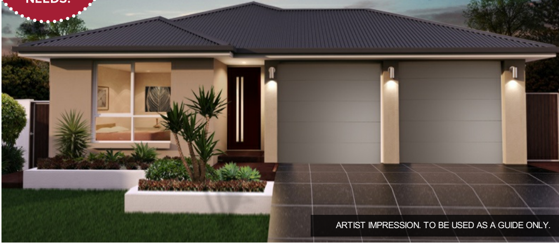
ARTIST IMPRESSION. TO BE USED AS A GUIDE ONLY.

YOU CAN modify THIS DESIGN TO SUIT YOUR NEEDS.