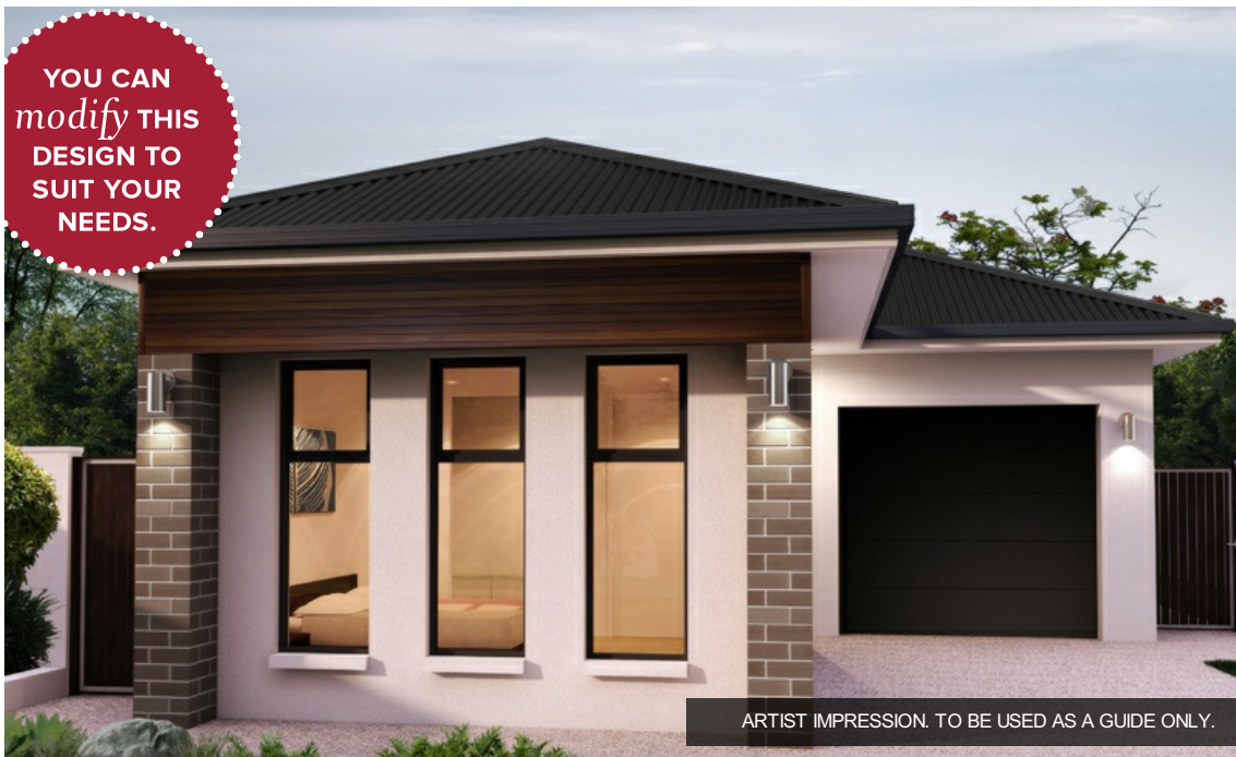
ARTIST IMPRESSION. TO BE USED AS A GUIDE ONLY.

YOU CAN modify THIS DESIGN TO SUIT YOUR NEEDS.