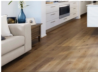
Timber laminate floorboards

homesolution 13 10 55 | homesolution.com.au