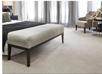
Luxury carpet to bedrooms