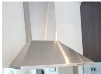
Stainless steel rangehood