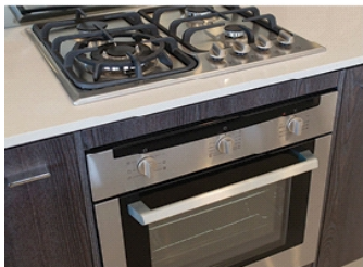
Stainless steel oven & cooktop